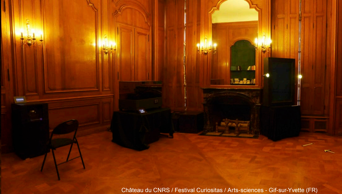
Château du CNRS / Festival Curiositas / Arts-sciences - Gif-sur-Yvette (FR)